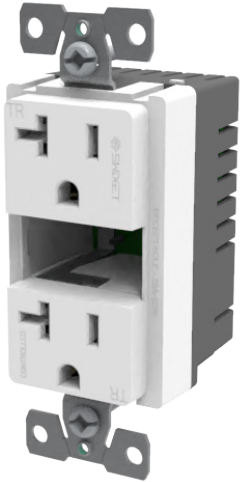
20A, 125VAC 5VDC, 2.0A NEMA 5-20R